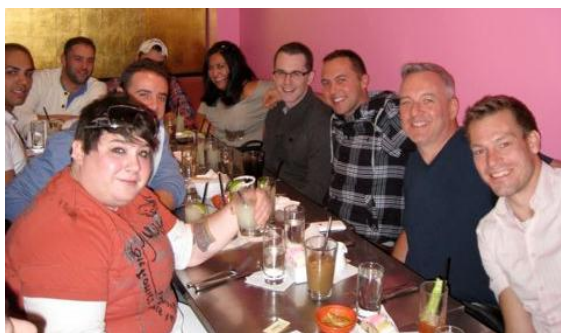
Brunch at the Rocking Horse Cafe

On a Sunday in early November, more than 20 DGALA members spanning classes from at least four decades joined forces to (successfully) tackle unlimited drinks and delicious Mexican cuisine at The Rocking Horse Café in Chelsea. While devouring endless portions of buttermilk "panqueques" and huevos beneditos, alums reminisced about life back at Dartmouth and took the opportunity to catch up on more recent endeavors. The brunch was subsidized by DGALA, and is one of many social gatherings organized by the NYC group throughout the year. Upcoming events include a holiday party, a dinner following the holiday party at the Dartmouth Club, and at least a few evenings at a bar or two. If you'd like to organize an event in your area, e-mail DartGALA@gmail.com . ❖