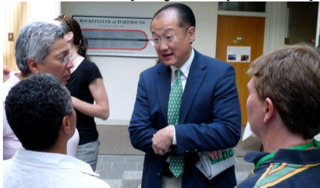
President Kim Chats with Alums at Breakfast

great creativity. It was different for me than for all of you, but I think celebrating difference and embracing it is a path not just for a normal life but for a kind of heroism that I saw [during the early AIDS crisis].