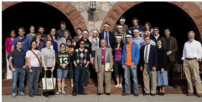
Bishop Gene Robinson with PRIDE celebrants outside Rollins Chapel