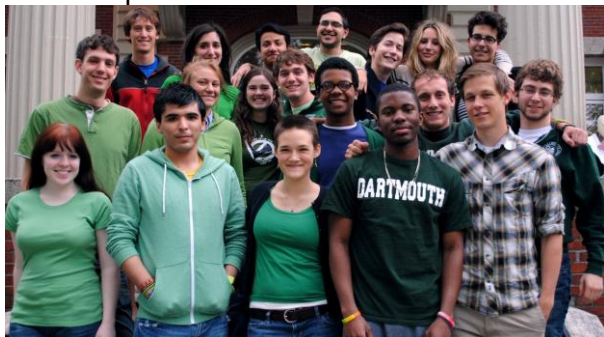
Mentors in front of Collis Hall after a Training Session