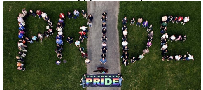
Aerial Photo of Students Showing PRIDE on Green